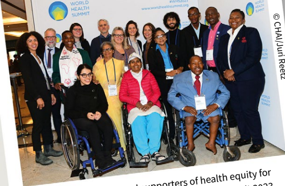
Above: Self-advocates and supporters of health equity for persons with disabilities at the World Health Summit 2023 in Berlin.

There is still a lot to do. In 2024, the UN convenes the Summit of the Future, where member states are expected to agree on a Pact for the Future to advance the SDGs and address global challenges such as peace, climate change, and sustainable financing. CBM is actively involved in this process, providing oral and written submissions and participating in civil society initiatives to ensure the representation of the rights of people with disabilities in the Pact.